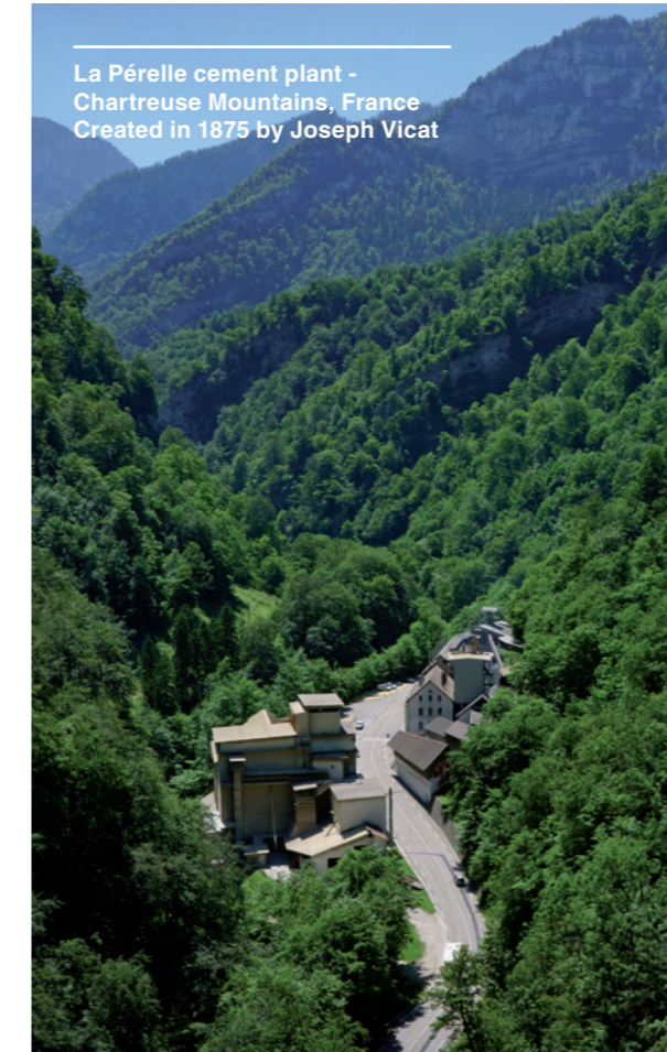
La Pérelle cement plant - Chartreuse Mountains, France Created in 1875 by Joseph Vicat

Unlike hydraulic lime, the stone contains very little free lime and is not slaked after burning. This special characteristic is why it is termed natural cement as opposed to natural hydraulic lime.